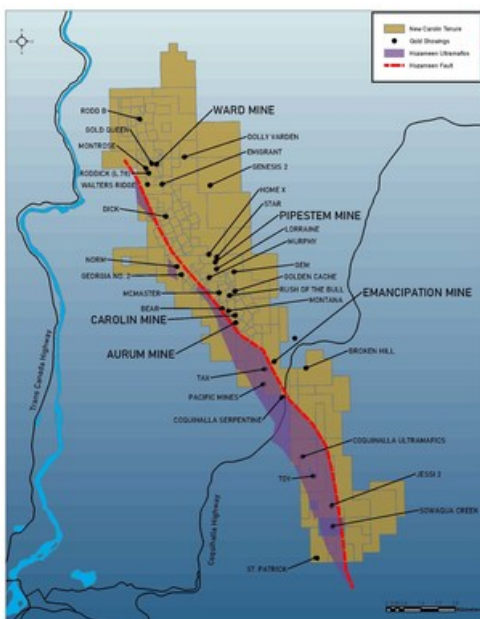
Ladner Gold Project Showing Former Producing Mines and Mineral Occurrences

The forward-looking information contained in this release is made as of the date hereof, and Talisker is not obligated to update or revise any forward-looking information, whether as a result of new information, future events or otherwise, except as required by applicable securities laws. Because of the risks, uncertainties and assumptions contained herein, investors should not place undue reliance on forward-looking information. The foregoing statements expressly qualify any forward-looking information contained herein.