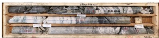
Figure 1: Photo of the 53 Vein intersected at 585.9m depth.

Figure 1: Photo of the 53 Vein intersected at 585.9m depth.